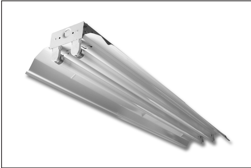
SEI Pivot End Shallow Economy Strip