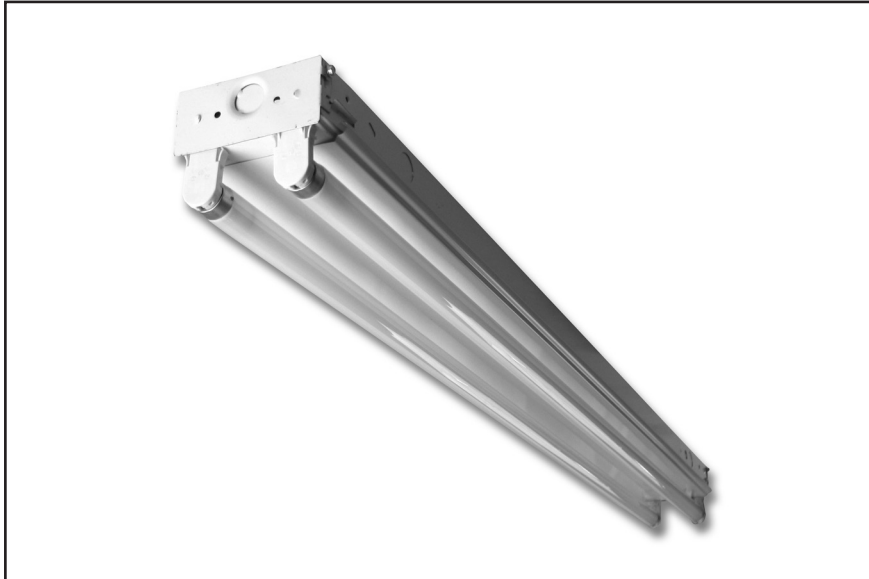
SEP Shallow Economy Industrial