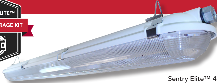
Sentry Elite™ 4' with Parking Garage Lens

A.L.P. engineers have focused decades of expertise in vapor tight fixture kits to develop the feature-packed Sentry Elite™. It has all the performance advantages you've come to expect from the Sentry product family, plus many improvements, all optimized for today's LED applications.